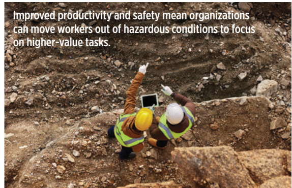
Improved productivity and safety mean organizations can move workers out of hazardous conditions to focus on higher-value tasks.

Tapping into efficient and cost-effective COM Express technology, fleet operators are capitalizing on machine-to-cloud and machine-to-machine communications. The world of heavy mobile equipment is poised to un-