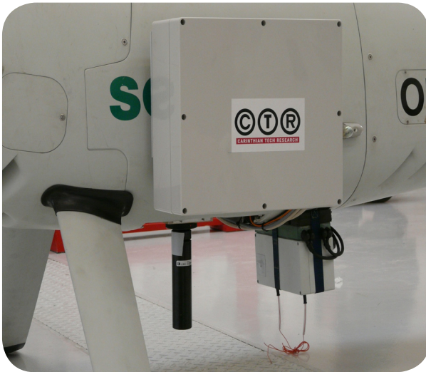
Figure 1: Thanks to the compact size and low weight of the embedded box PC it could easily be fastened to a port on the side payload of the Schiebel CAMCOPTER® S-100 without negatively affecting its flight characteristics.