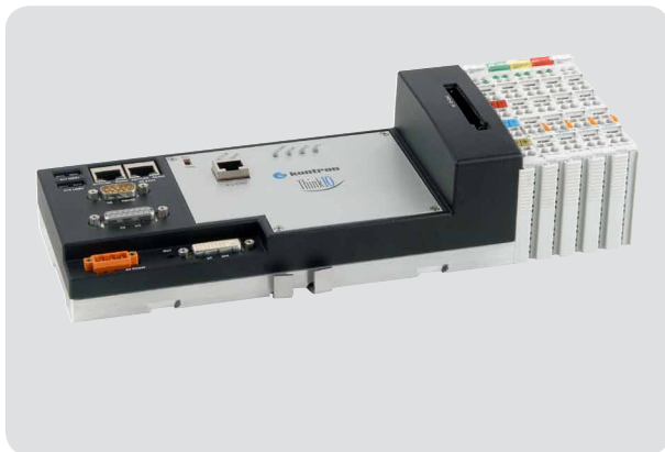
Image 3: The Kontron ThinkIO-Duo offers an extensive range of interfaces, from the standard PC to industrial fieldbus and Ethernet interfaces in an ultra-compact unit, which can be optionally extended with the optional modular Wago IO system.

"The ThinkIO-Duo offers optimal characteristics for our H3-D measuring method: it is small, robust and delivers multi-core performance for high-speed image processing", explains Dipl.-Ing. Manfred Weber, development engineer at ProContour GmbH. "Due to the fact that we could integrate the ThinkIO-Duo in our measuring heads, it has increased the mobility of the system and its tamper-proof qualities for data security."