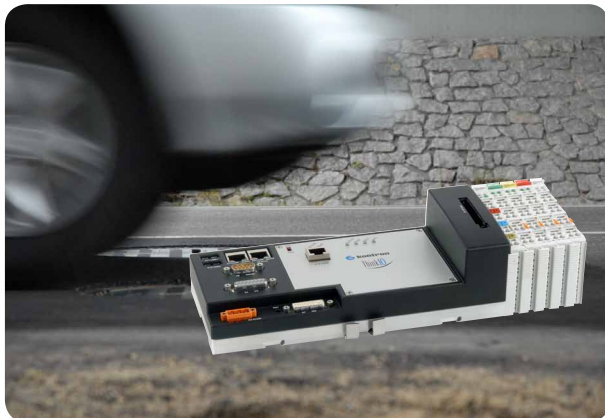
Image 1: The image processing system ProContour H3-D measures tire tread depths at up to 120 km/h in moving traffic

Worldwide, poor tire treads are one of the most common technical reasons for traffic accidents: In wet and slippery road conditions, tires with low tread depth lose their grip on the road surface. That can result in extended braking distances. The danger of aquaplaning is also increased, the vehicle skims over the surface and goes out of control. Spot-checking of the depth of tire tread is only however carried out by the police at irregular intervals. Dynamic measurement of tire tread depth could bring about a radical change: In flowing traffic, 100 percent of all vehicles, trucks, buses and cars could be controlled. The measuring system ProContour H3-D is such a system. It is available in several different versions. Applications have already been submitted to the Physical-Technical Institute (PTB) (national metrology institute providing scientific and technical services), for technical approval of a design which achieves results which can be used in court as evidence. Critical stretches of roads could be subject to nearly 100% supervision for increased road safety. The system automatically measures tread depth and tread type and can provide the information via Ethernet cable or wireless LAN in order to control warning systems, barriers, camera systems or even road blockages.